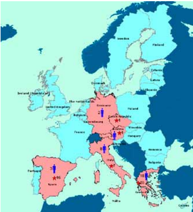
Figure 7: Number of failed, foiled or completed attacks and number of suspects arrested for left-wing and anarchist terrorism in Member States in 2010

Left-wing terrorist groups seek to change the entire political, social and economic system of a state according to an extremist left-wing model. Their ideology is often Marxist-Leninist. The agenda of anarchist terrorist groups is revolutionary and anti-capitalist but also anti-authoritarian.