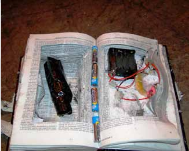
Parcel bomb, Greece

Increased violence in left-wing and anarchist attacks, which has been seen since 2007, persisted in 2010 . In Greece, attacks claimed the lives of six people in 2010. The explosion of a parcel bomb at the Ministry for Citizen Protection on 24 June killed a police officer. On 19 July, a journalist was murdered outside his house. This particularly violent attack involving firearms was claimed by the organisation Sekta Epanastaton and it could be linked to the assassination of a police officer in 2009. Both of these attacks were clearly designed to kill. Despite the fact that left-wing and anarchist extremists generally try to avoid casualties in most of their attacks, a 15-year-old boy died on 28 March when he manipulated an explosive device ostensibly placed to carry out a terrorist attack; his mother and sister were injured. During a demonstration in Athens on 5 May, anarchists caused a fire in a bank, which resulted in the death of three employees.