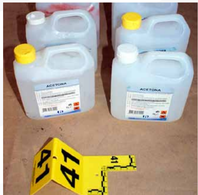
Precursors for home-made explosives, ETA, Portugal

The announcement, in June 2010, of the PKK/KONGRA-GEL intention to enter a more violent period of its history was immediately followed by the declaration of a cease-fire which was, in turn, belied by the bomb attack in Istanbul in October 2010. No execution of attacks in the EU show the PKK/KONGRA-GEL's double strategy of armed struggle in Turkey while at the same time seeking to gain a greater degree of legitimacy abroad. It is assumed that the organisation will continue to follow this double strategy. The terrorism threat posed by the PKK/KONGRA-GEL to EU Member States and the intention can currently be considered as relatively low. However the large number of PKK/KONGRA-GEL militants living in the EU and the continuing support activities in the EU, like large demonstrations organised in the past, show that the PKK/KONGRA-GEL is in a position to mobilise its constituency at any time and is an indication that it maintains the capability to execute attacks in the EU.