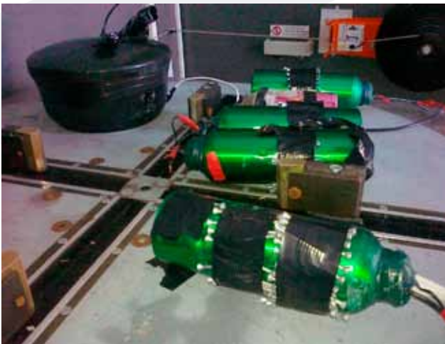
Bomb suicide attack, 11 December, Sweden

Prophet Muhammad by the Swedish painter, Lars Vilks. A second explosion occurred 10 minutes later, a few streets away from the first explosion. In this case, the suspected suicide bomber himself was the only fatality.